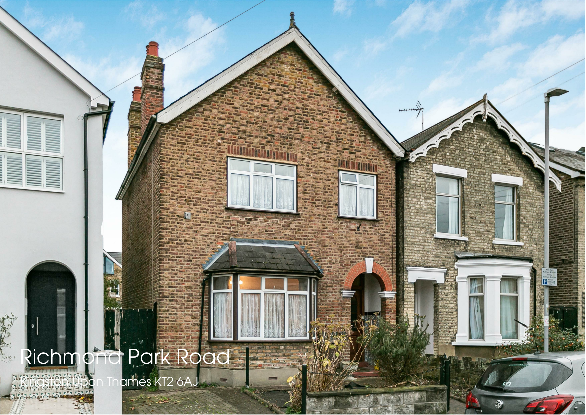
Richmond Park Road Kingston upon Thames KT2 6AJ